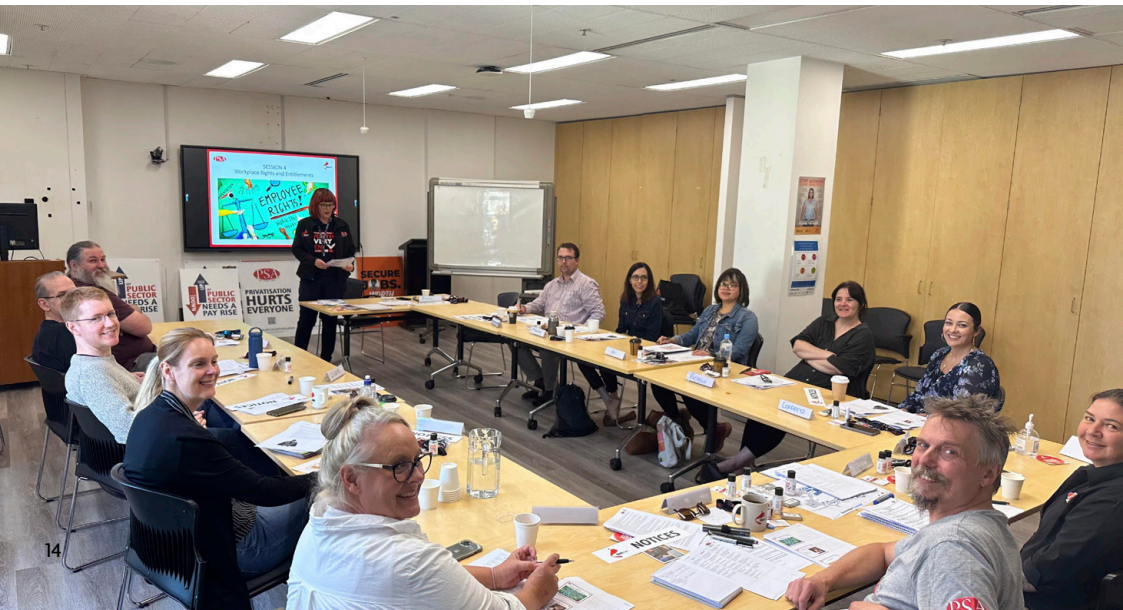
HERC members meeting at the CPSU NSW head office

Central Council is the union's chief governing body. It consists of the Executive plus 39 delegates elected from across the union's diverse membership. It holds eight meetings per year.