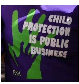
(https://psa.asn.au /?post_type=post& p=41105)

(https://psa.asn.au /?post_type=post& p=41168)