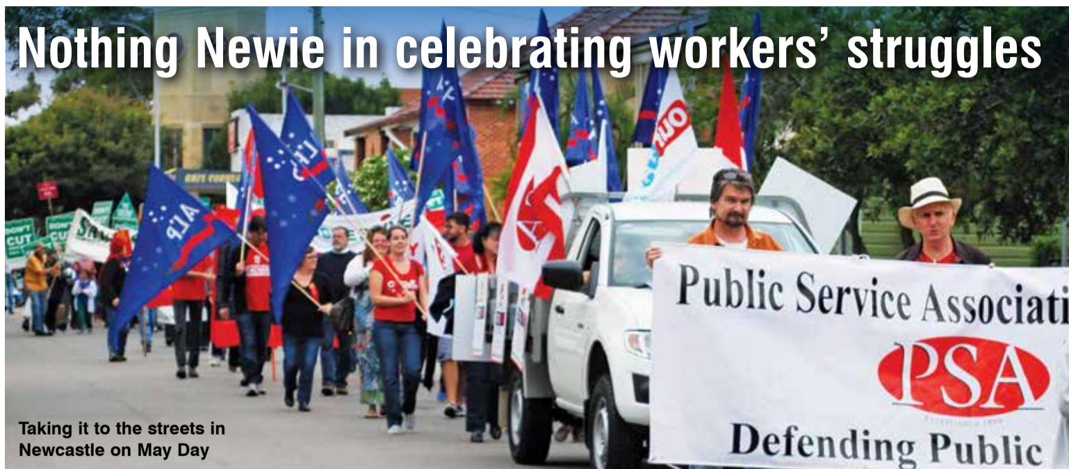
Taking it to the streets in Newcastle on May Day