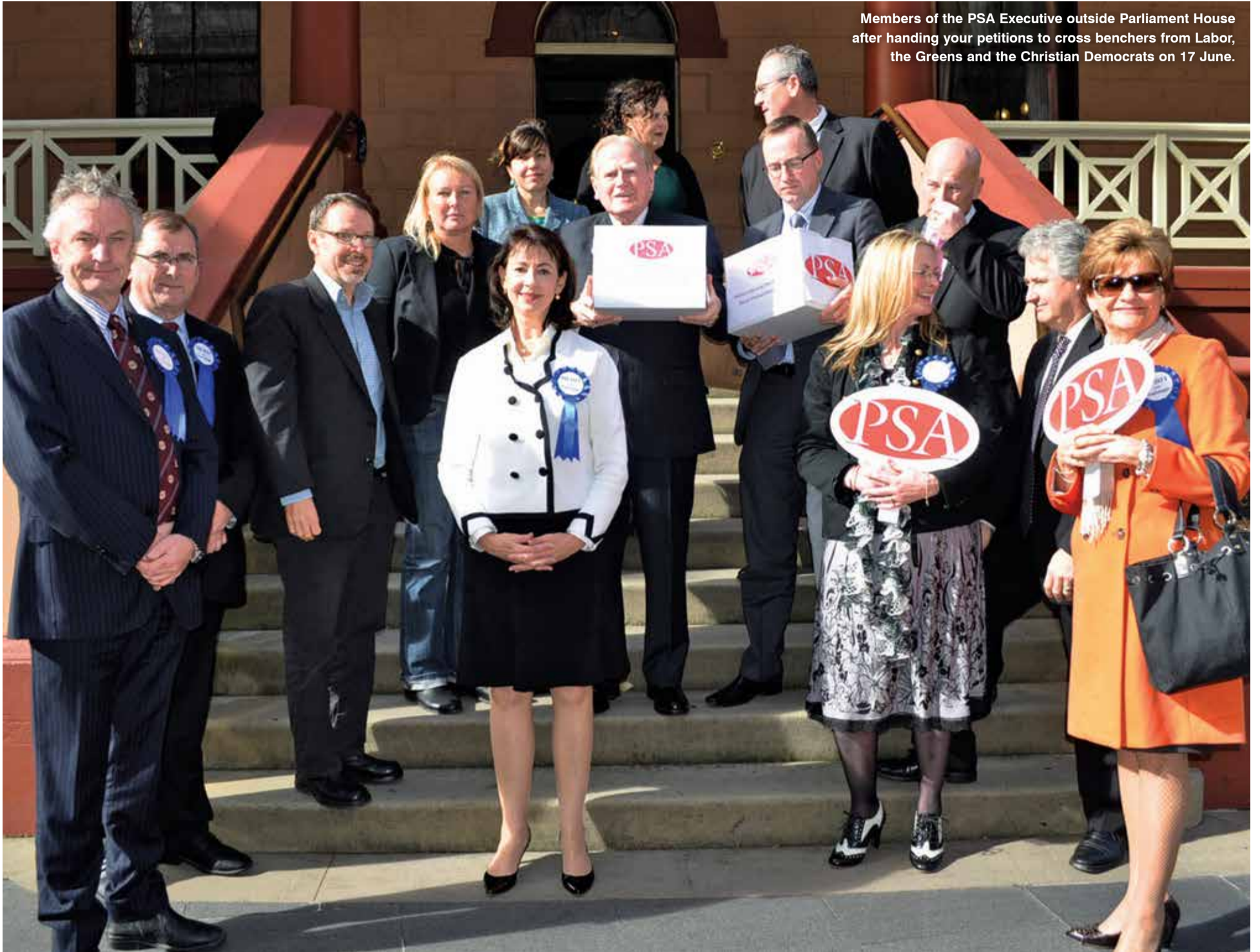
Members of the PSA Executive outside Parliament House after handing your petitions to cross benchers from Labor, the Greens and the Christian Democrats on 17 June.