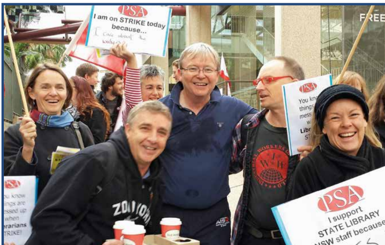
Kev lends a hand at State Library picket