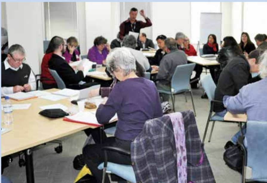
A meeting of the TAFE Departmental Committee at PSA House.